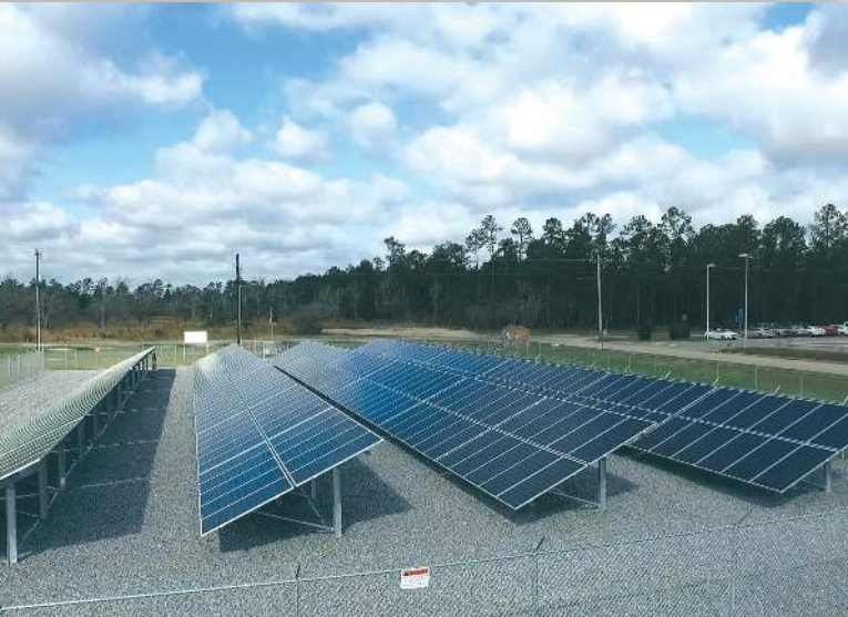
Coast Electric's solar farm in Kiln is a 96KW site that helps to diversify the cooperative's energy portfolio. If you are interested in purchasing output from our solar farm, please call 877-769-2372 and ask about our Cooperative Solar Program.